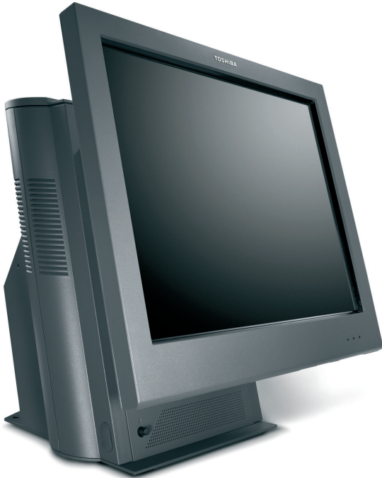
Shown: Toshiba SurePOS 500 Model 580