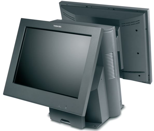
Shown: Independent customer display (12" display) delivers customer information and digital, multi-media merchandising (optional)