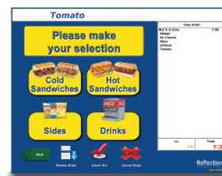
Customer Self Ordering