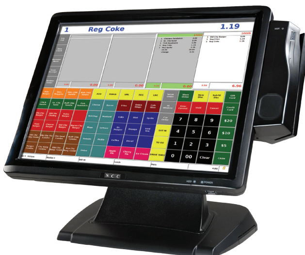
Flexible screen layouts

Reflection POS is the most complete and reliable quick service restaurant management system on the market. Reflection POS adapts to your way of doing business, making it easy for managers and employees to learn and to operate. Reflection POS can handle single-window, dual-window and two-lane drive-thru operations. Orders are routed to kitchen video devices and kitchen printers for food preparation and expediting. Reflection POS enables restaurateurs to provide fast and accurate service, making for an enjoyable dining experience for customers.